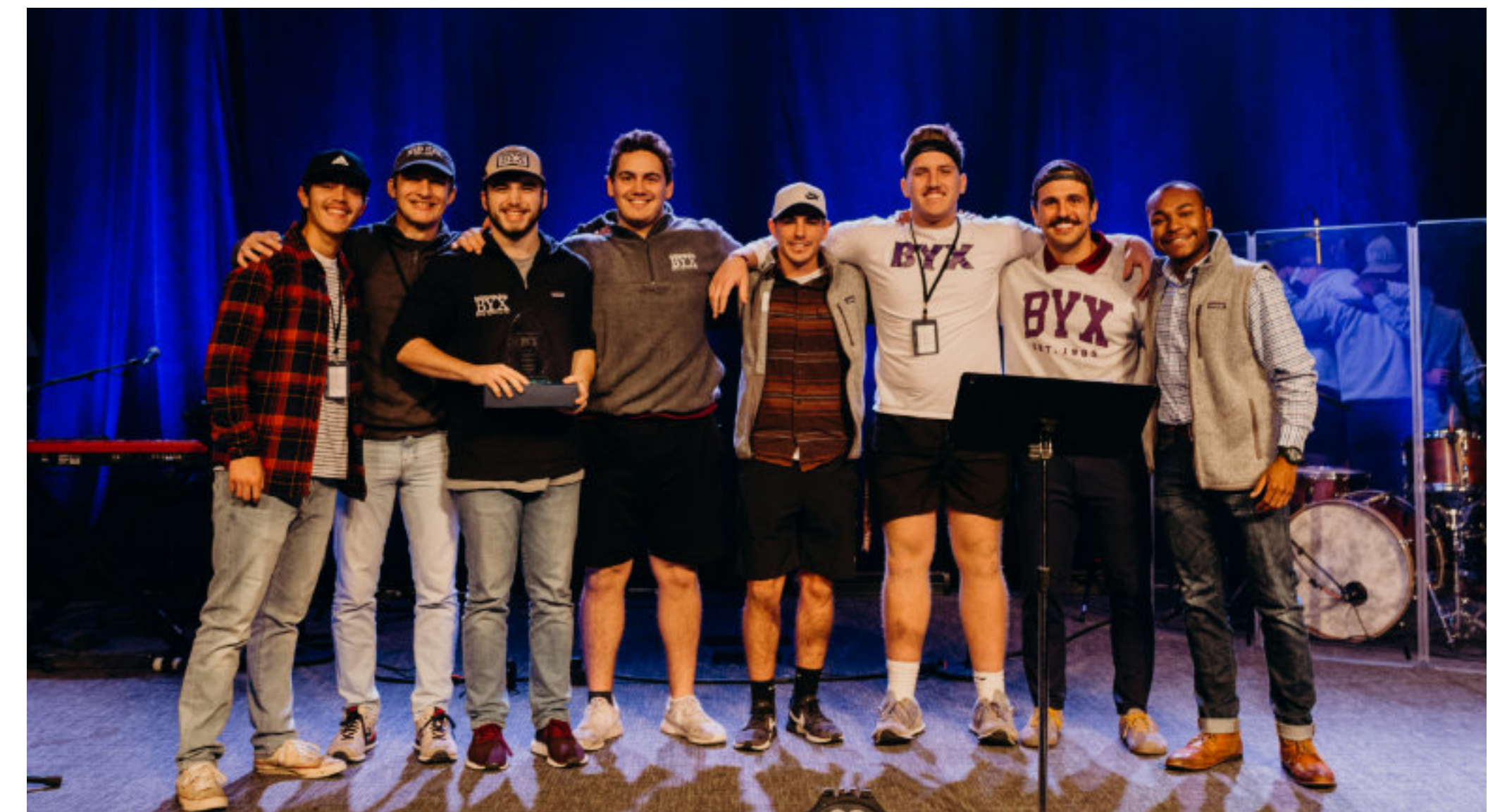
RECRUITMENT AWARD TEXAS STATE UNIVERSITY