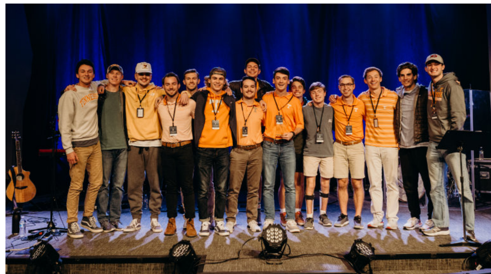
NATIONAL UNITY AWARD UNIVERSITY OF TENNESSEE