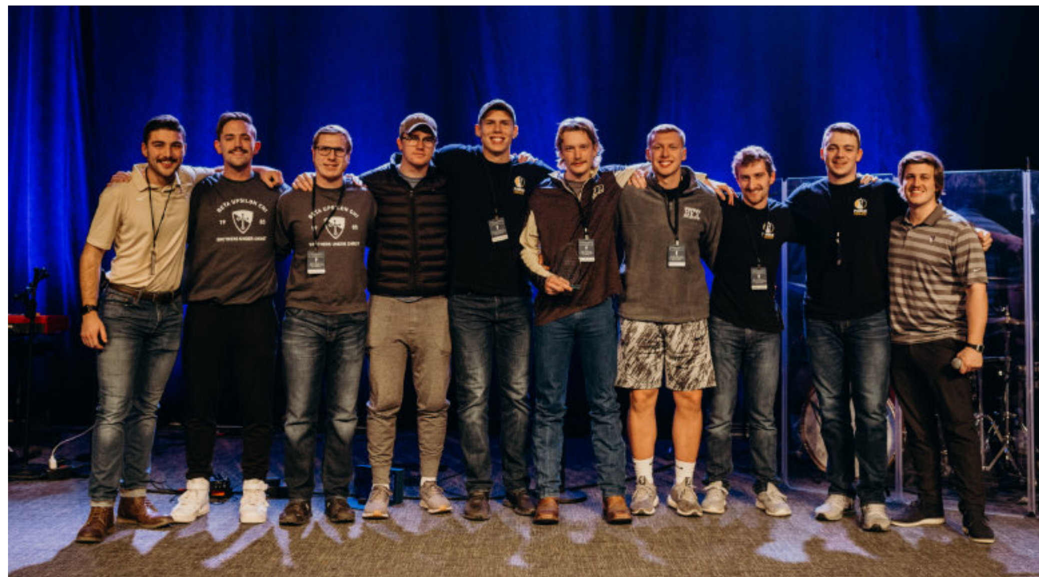
LEADERSHIP AWARD PURDUE UNIVERSITY