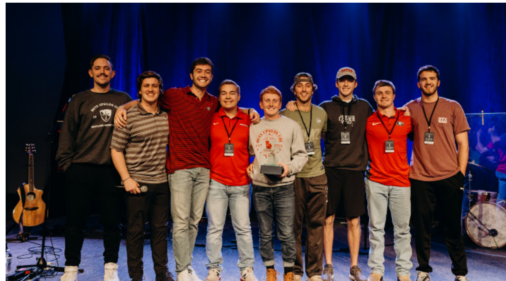
CAMPUS PRESENCE AWARD UNIVERSITY OF GEORGIA