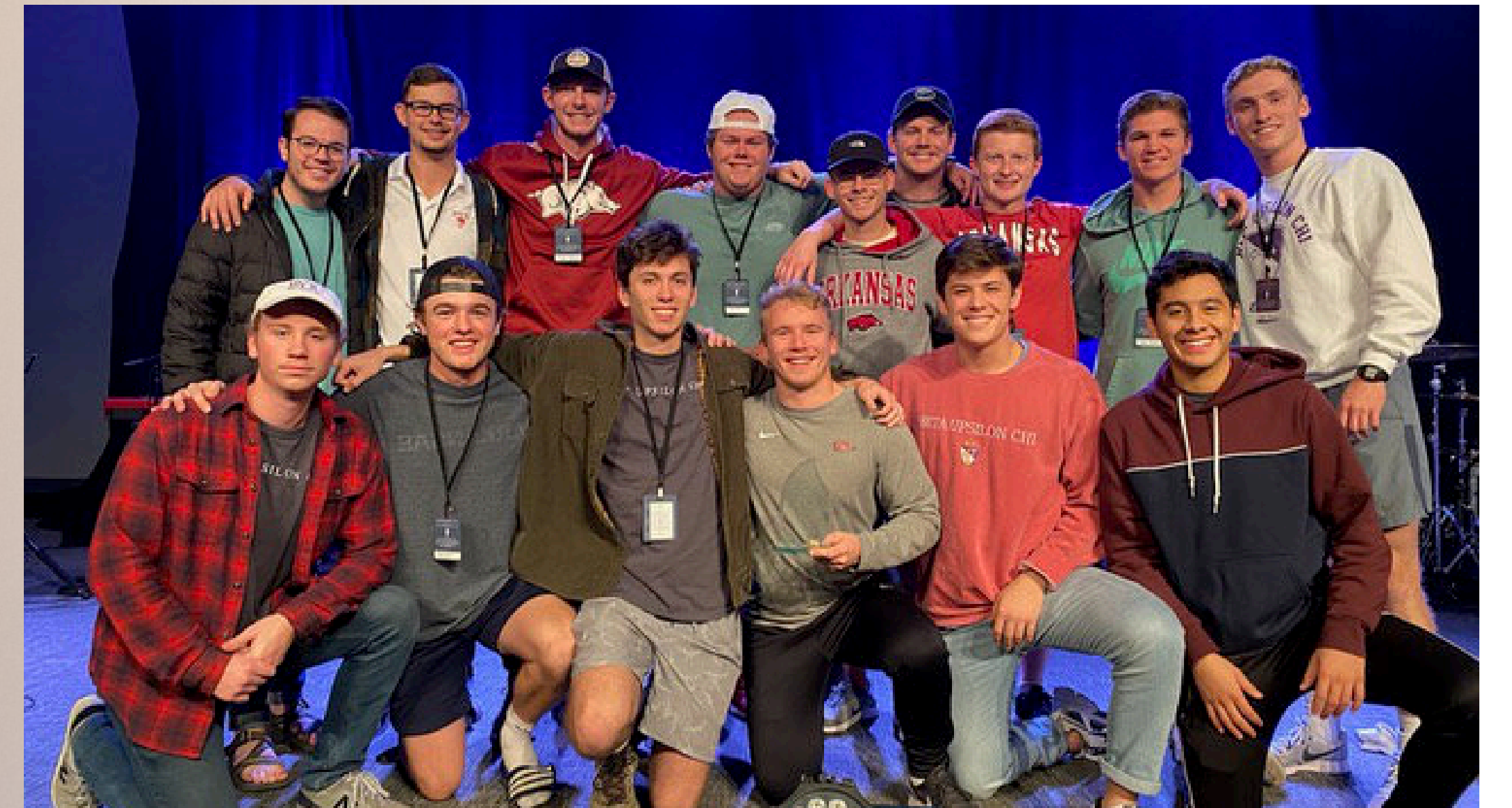
133 AWARD UNIVERSITY OF ARKANSAS