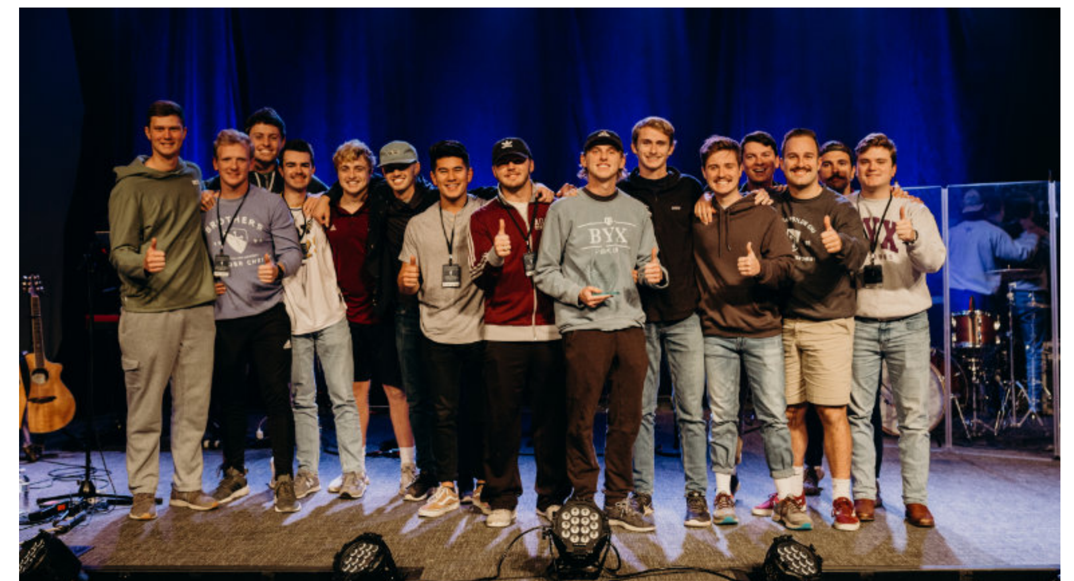
PHILANTHROPY AWARD TEXAS A&M UNIVERSITY