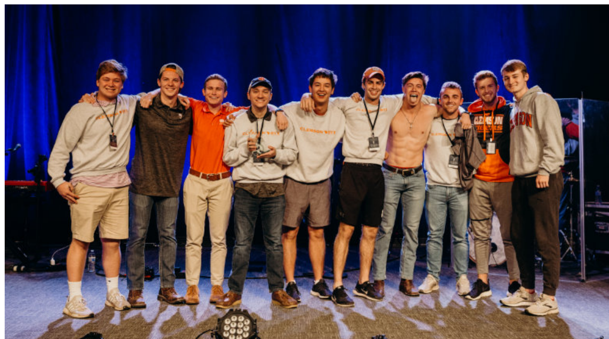
MOMENTUM AWARD CLEMSON UNIVERSITY