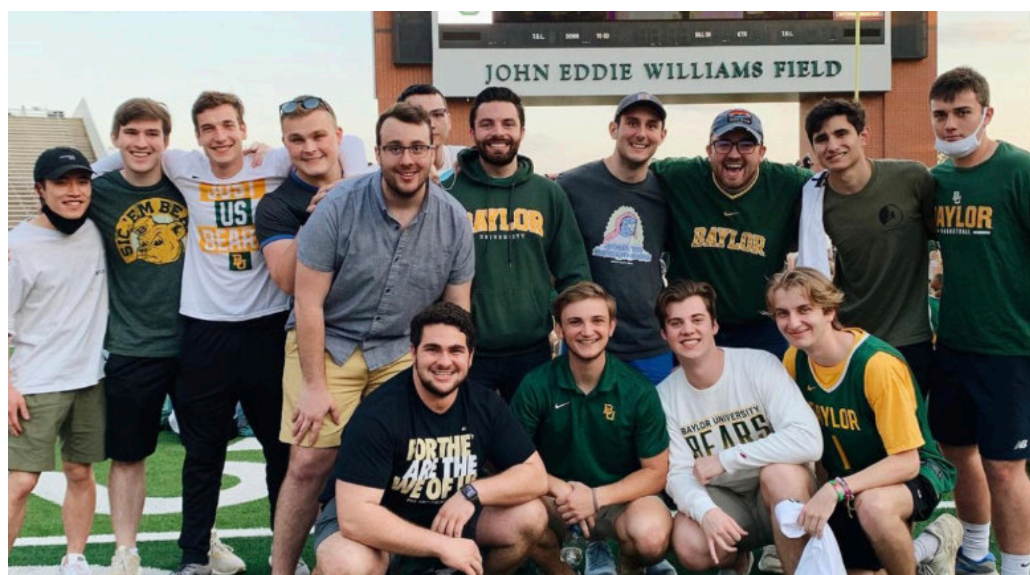
MOMENTUM AWARD BAYLOR UNIVERSITY