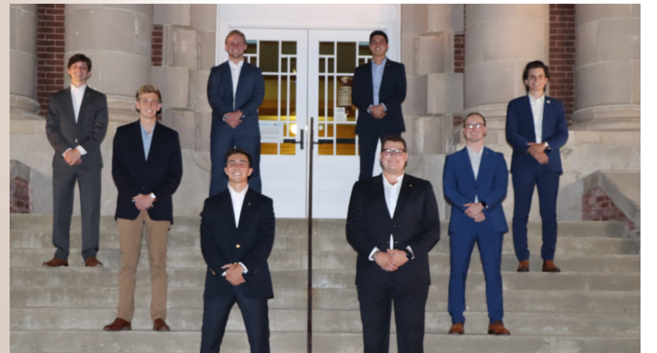
133 AWARD MISSISSIPPI STATE UNIVERSITY