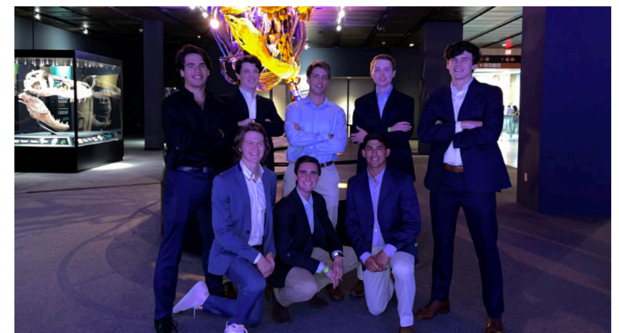
PHILANTHROPY AWARD UNIVERSITY OF TEXAS