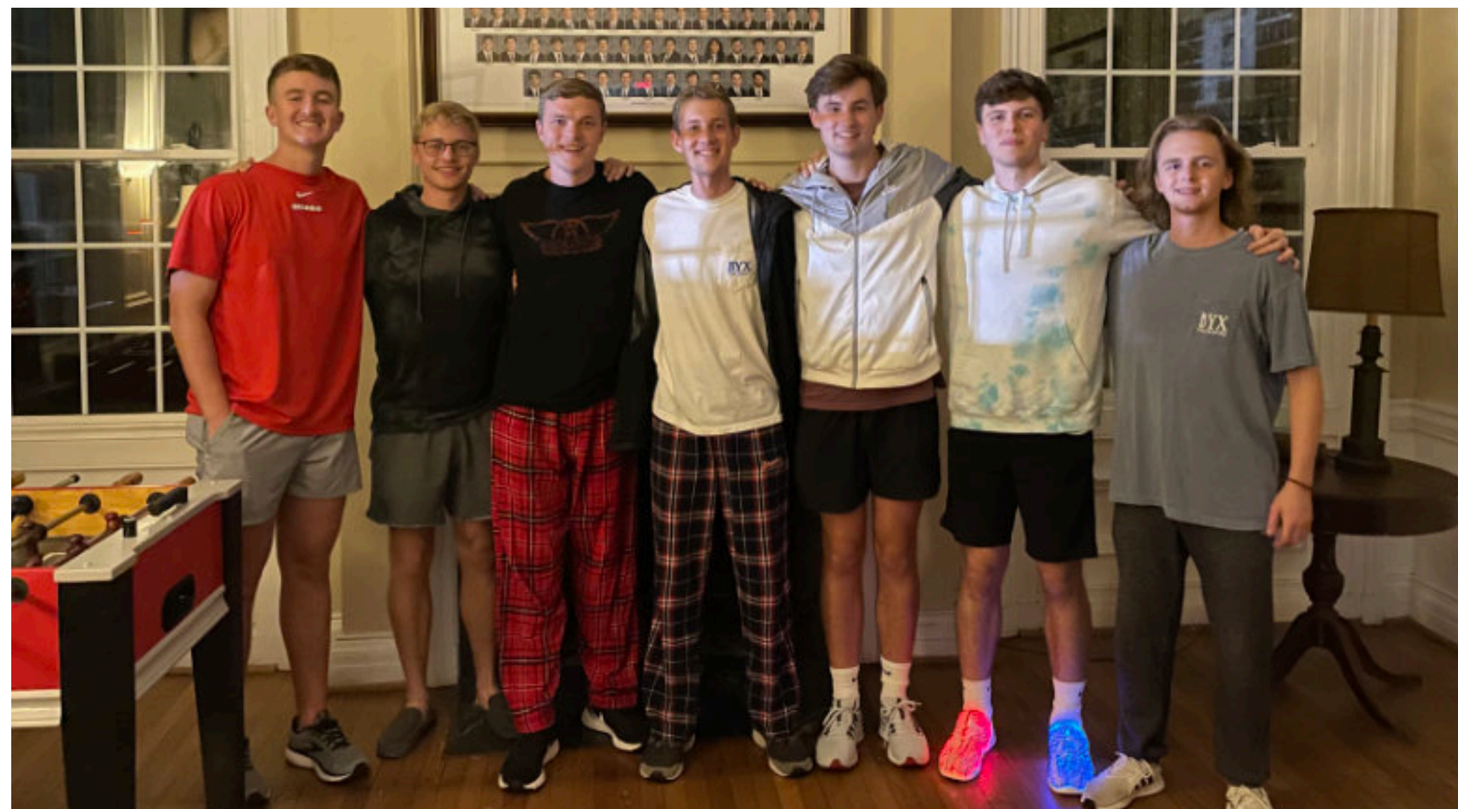
LEADERSHIP AWARD UNIVERSITY OF GEORGIA