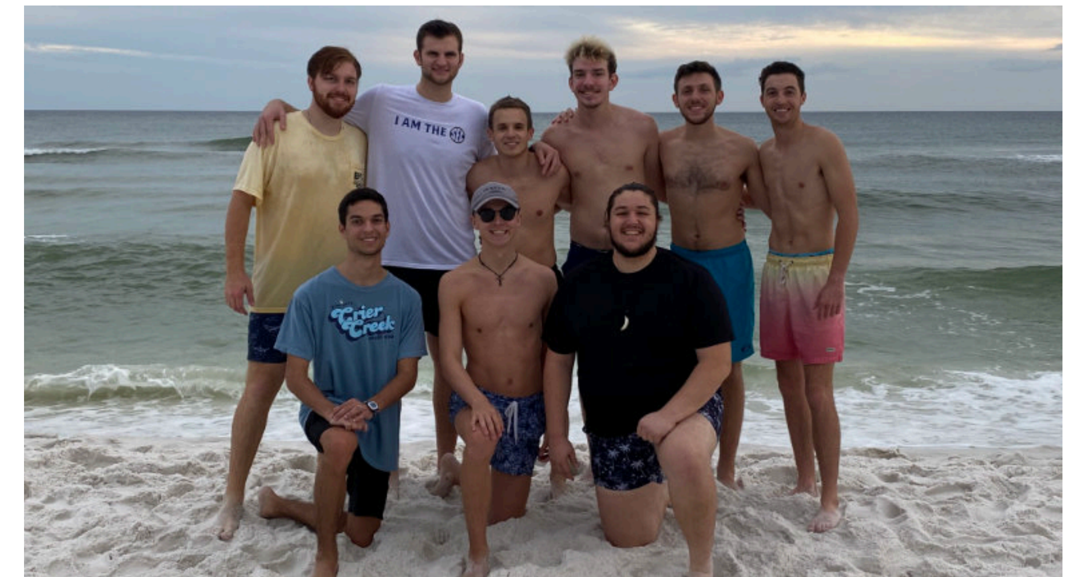
RECRUITMENT AWARD LOUISIANA STATE UNIVERSITY