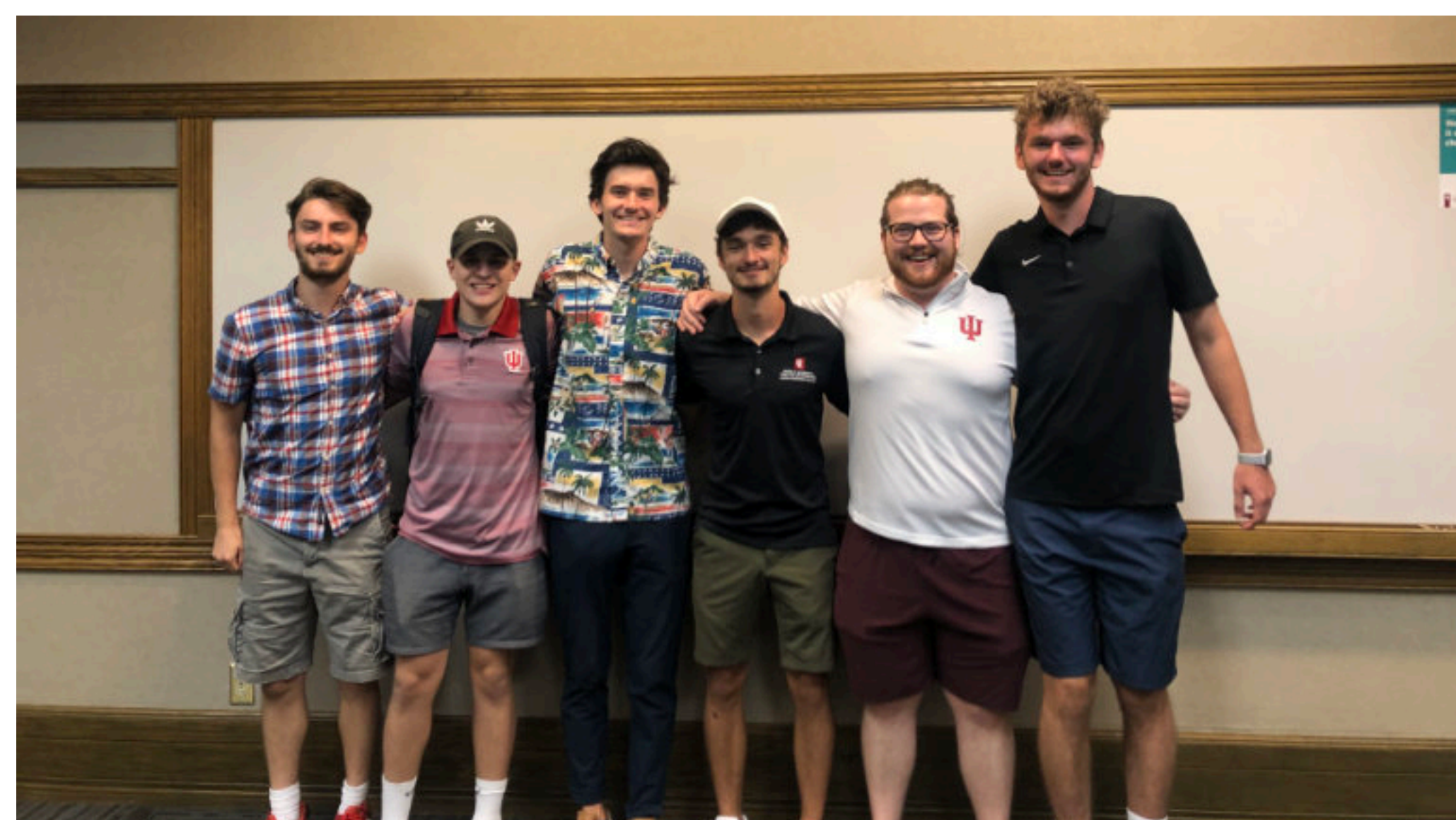
NATIONAL UNITY AWARD INDIANA UNIVERSITY