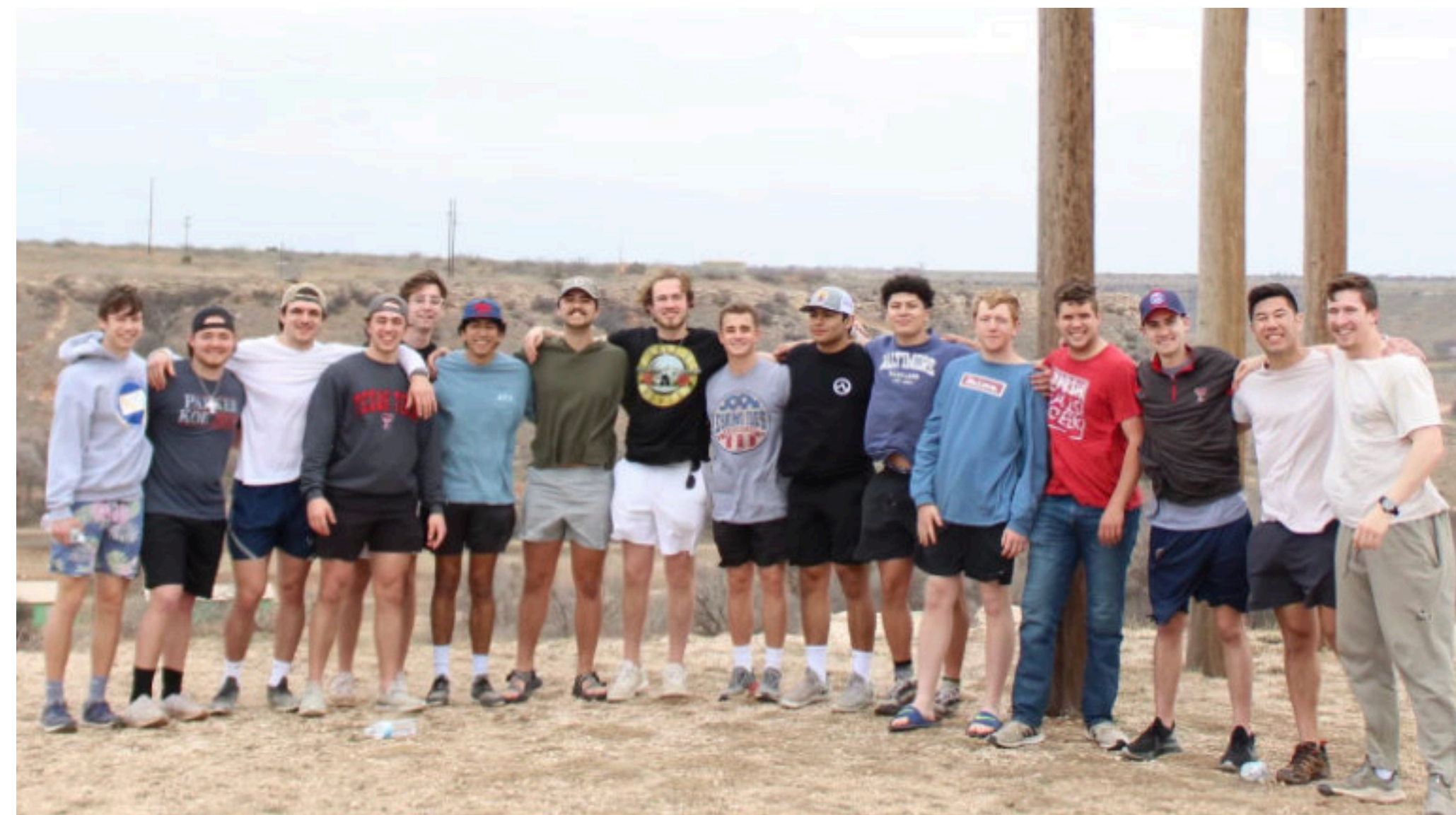
COVID RESPONSE AWARD TEXAS TECH UNIVERSITY