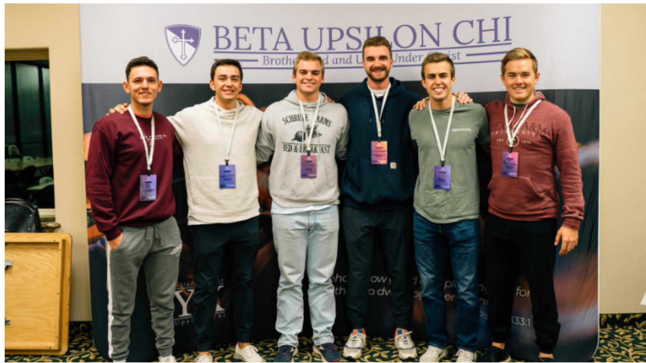
SOCIAL AWARD TEXAS A&M UNIVERSITY