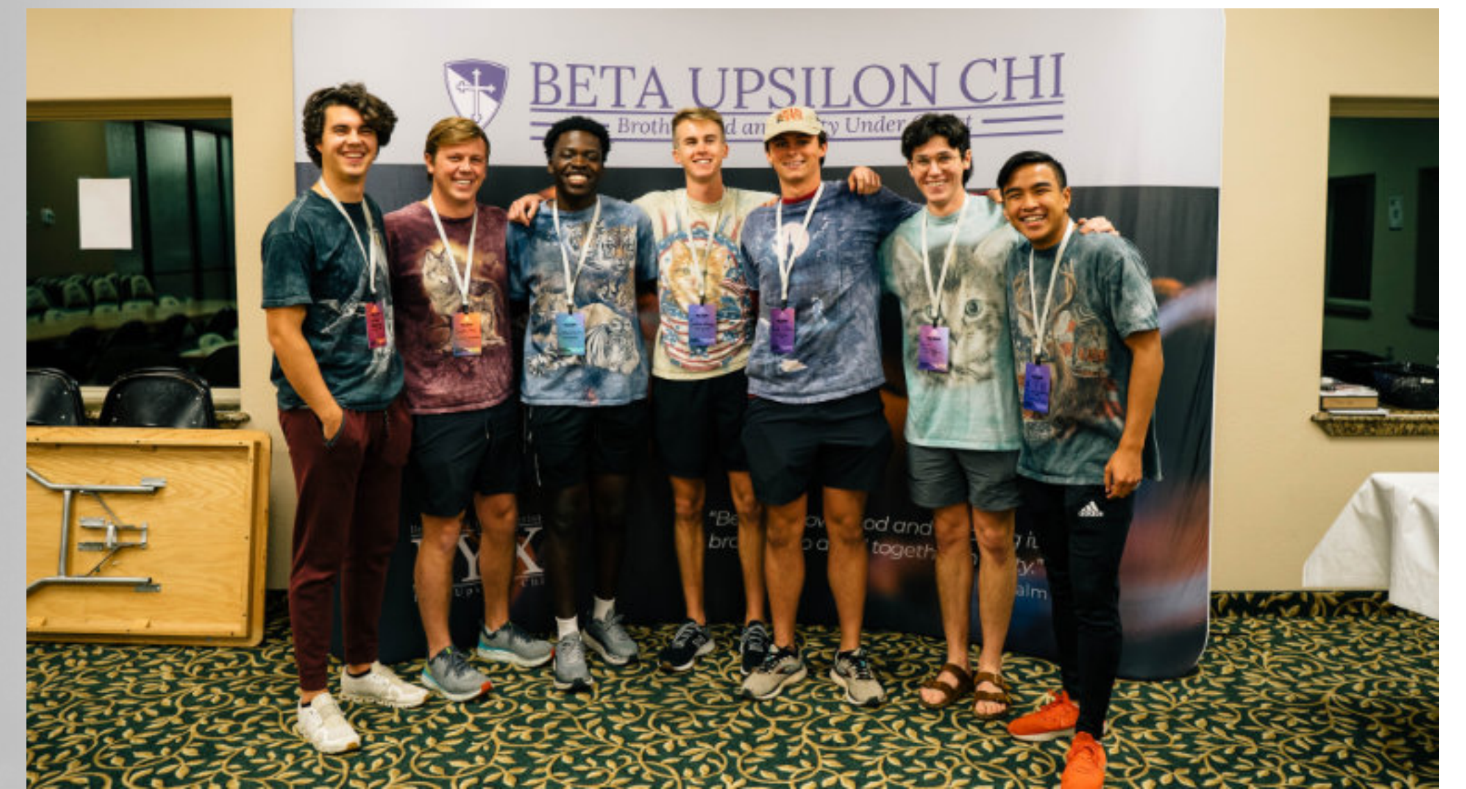
133 AWARD UNIVERSITY OF ARKANSAS