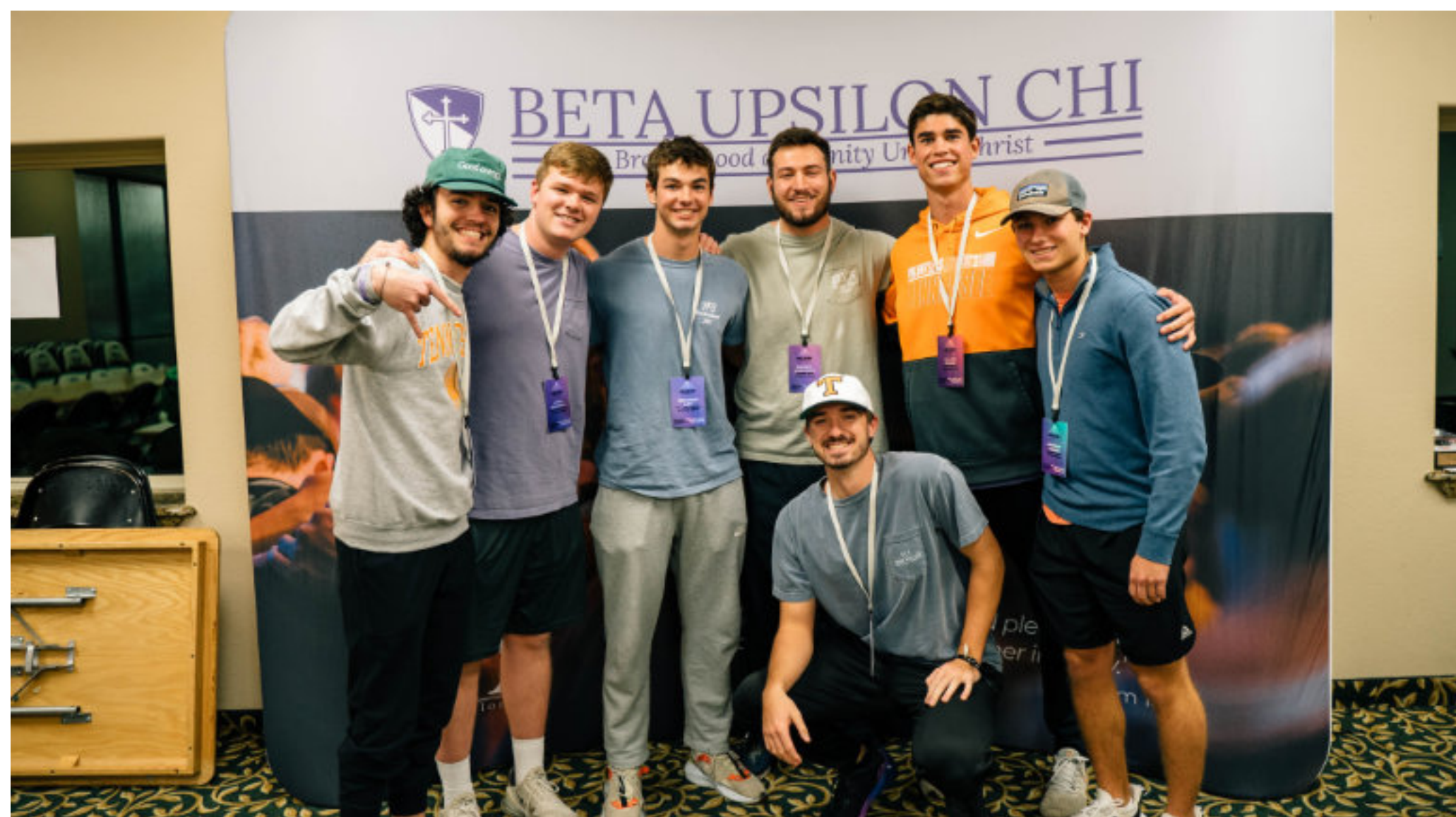
PLEDGESHIP AWARD UNIVERSITY OF TENNESSEE