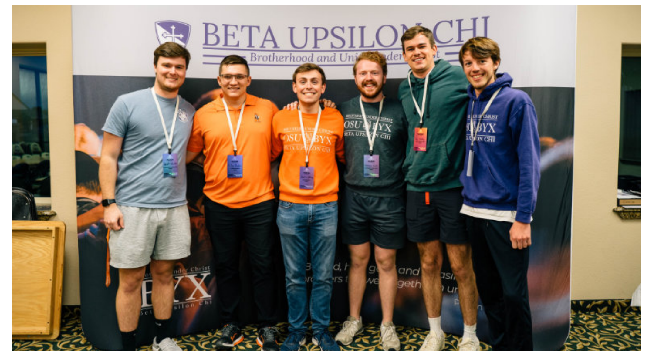
SPIRITUAL CULTURE AWARD OKLAHOMA STATE UNIVERSITY