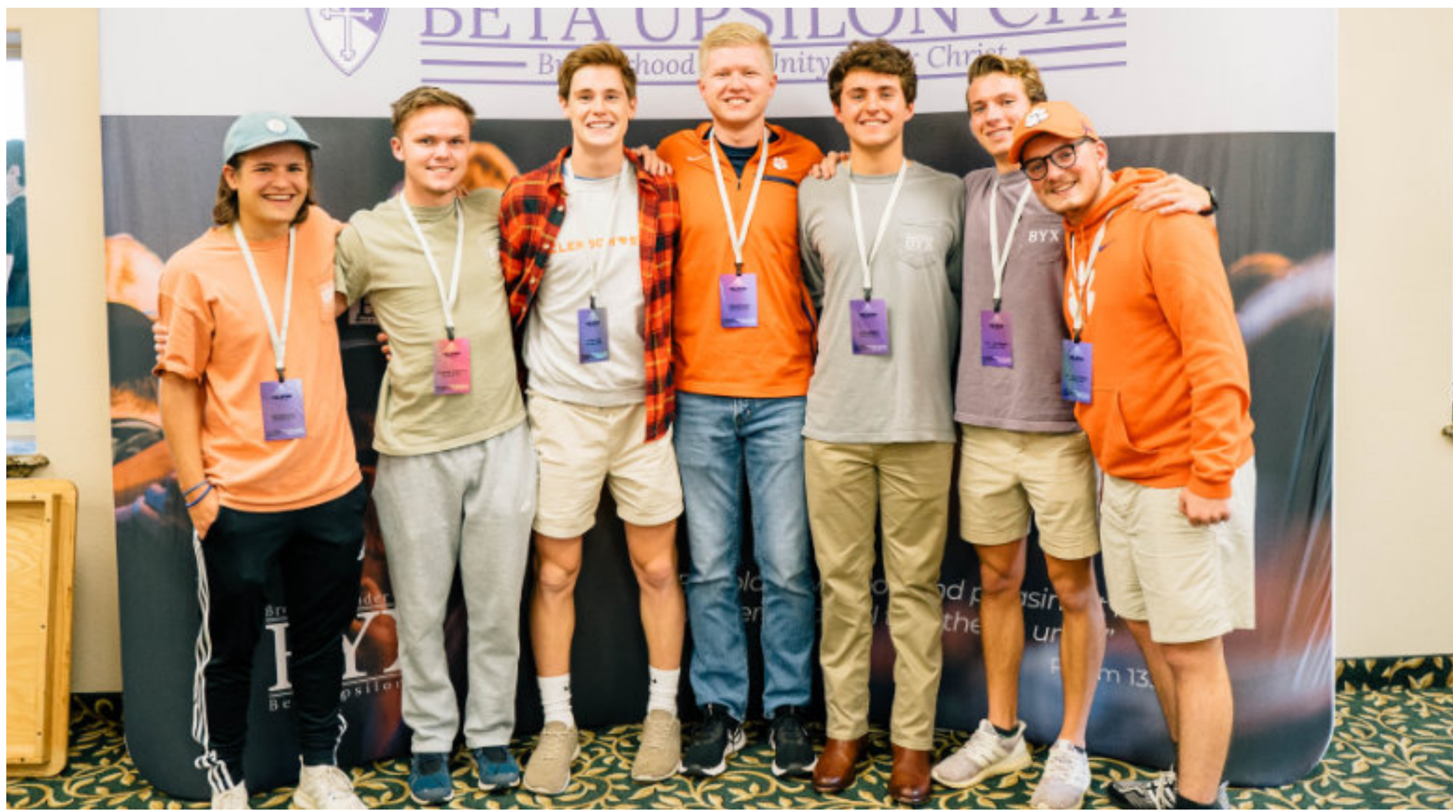
LEADERSHIP AWARD CLEMSON UNIVERSITY