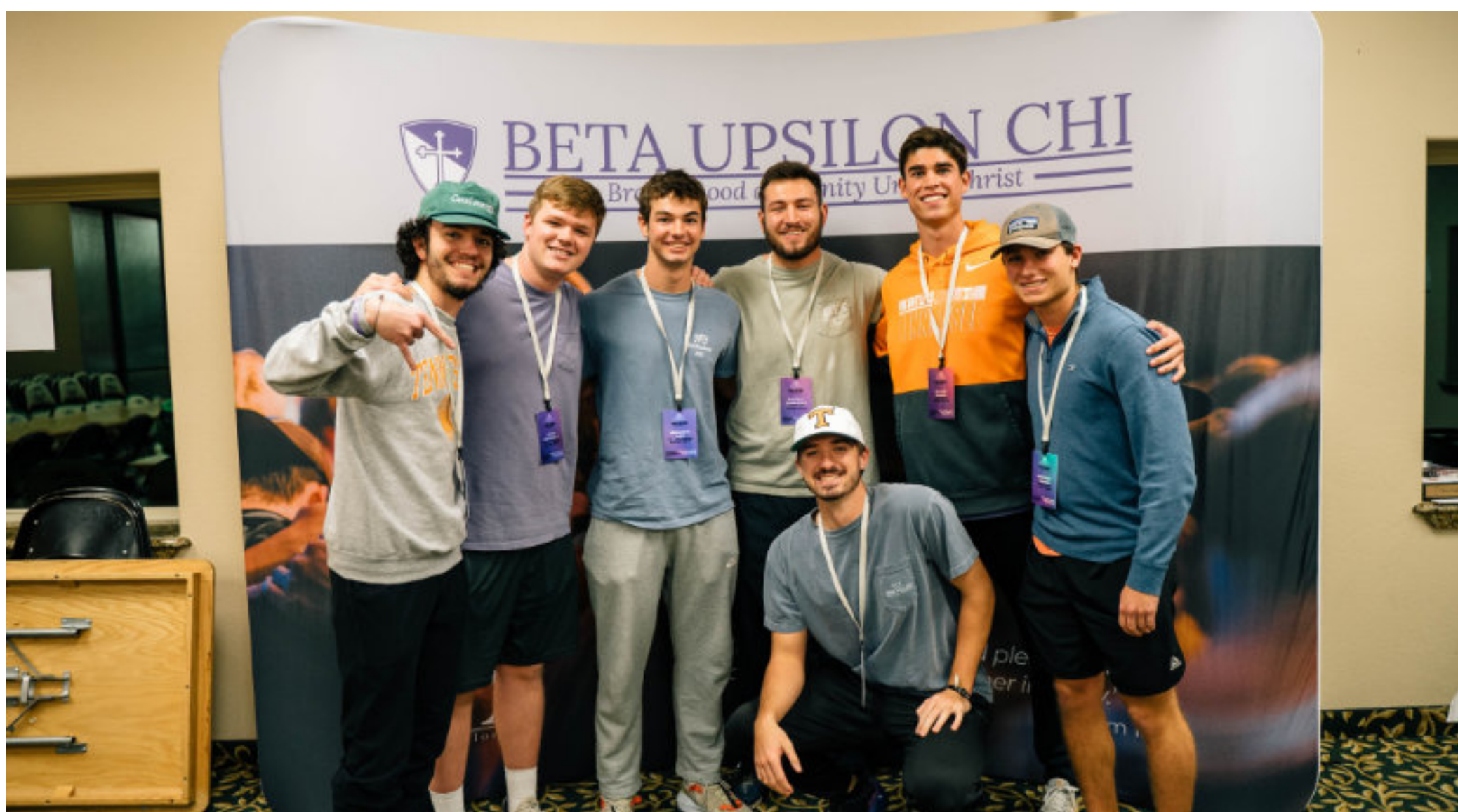
LEGACY AWARD UNIVERSITY OF TENNESSEE