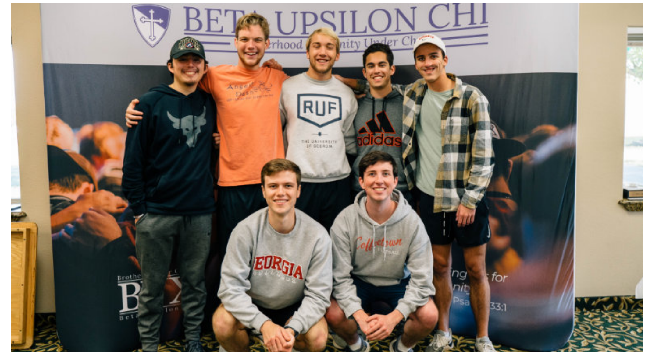
RECRUITMENT AWARD UNIVERSITY OF GEORGIA